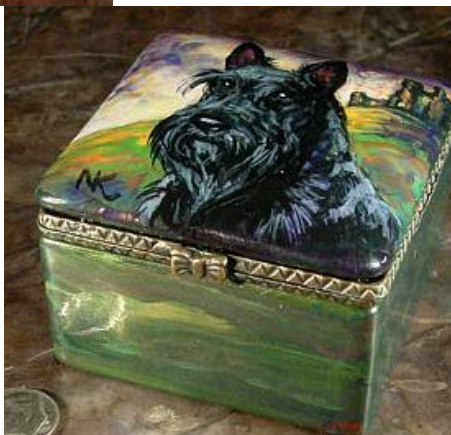
View of complete piece