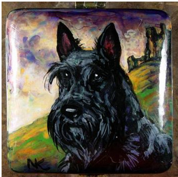
View of the top

The tickets are $5.00 each or 3 for $10.00.