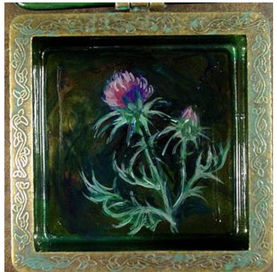
View of the inside